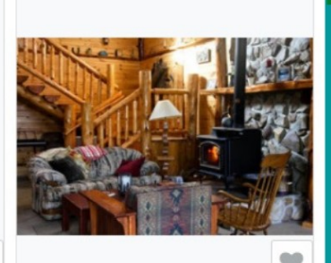
CABIN stay in the Rocky ...

Join people from all over the country to hear and see how God is blessing and moving through Mission Experience. There will be auction items available such as a week at a ski in/ski out Condo in Vail, four days at a large cabin near Fairplay CO and a Lakehouse in WI. To view the items and bid please go to: