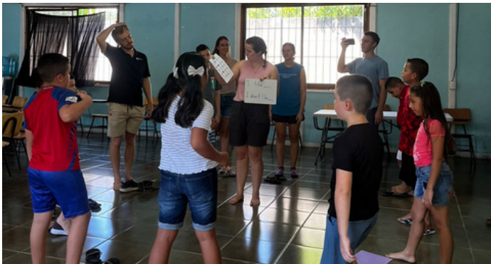
Playing a game at an elementary English club

With the start of a new school year, the LightHouse team has spent a fair amount of time over the past months discussing our purpose and plans for the year. As a growing organization, many new ideas and plans are being made to better our programs and serve the Parrita community. There is always some uncertainty of what our schedules and programs will look like, but we are sure of one thing, we want to be a consistent and safe presence for the teens in our community. Teens in Parrita are facing many challenges- instability in their homes and families, poverty, lack of resources, and increasing violence in the community. We cannot solve all of the problems our students face, but we can be a safe space where they can know they are cared for - by us, and more importantly, by Jesus.