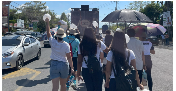
Walking with students at the Walk for Peace

Last week I had the opportunity to reflect on this idea as I participated in a "Walk for Peace" put on by several local organizations. In the face of a recent increase in violence, we came together with students from the Parrita High School to walk the streets of Parrita and declare that we want peace and safety in this community. It was an opportunity to physically walk alongside students as they face an issue in their community. Whatever our programs end up looking like this year, I pray we will be able to walk alongside our students and point them toward our Savior, who walks with us through all of the challenges we face.