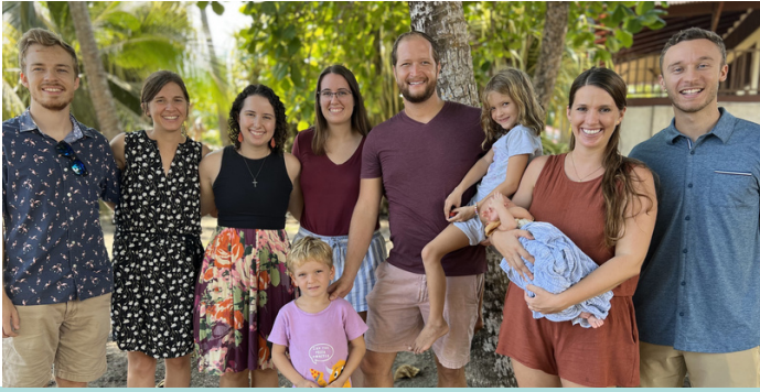
Our first picture of the whole LightHouse team!

With the start of a new school year, the LightHouse team has spent a fair amount of time over the past months discussing our purpose and plans for the year. As a growing organization, many new ideas and plans are being made to better our programs and serve the Parrita community. There is always some uncertainty of what our schedules and programs will look like, but we are sure of one thing, we want to be a consistent and safe presence for the teens in our community. Teens in Parrita are facing many challenges- instability in their homes and families, poverty, lack of resources, and increasing violence in the community. We cannot solve all of the problems our students face, but we can be a safe space where they can know they are cared for - by us, and more importantly, by Jesus.