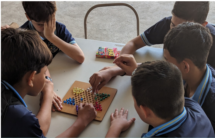
Student's learning Chinese Checkers

We started off well as we were able to be in the high school on the first day of classes and attended the school assemblies. This gave us the opportunity to be introduced to all of the new seventh graders and we have seen many of them show up at our Lunch Hour activities this month!