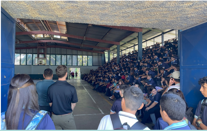
One of the first day of school assemblies

Our goal for this year is that LightHouse will be present in the high school every day that there are classes. Whether we are teaching English Classes, or leading activities during the lunch hour. We want students to know that they can depend on us being there every day that they are.